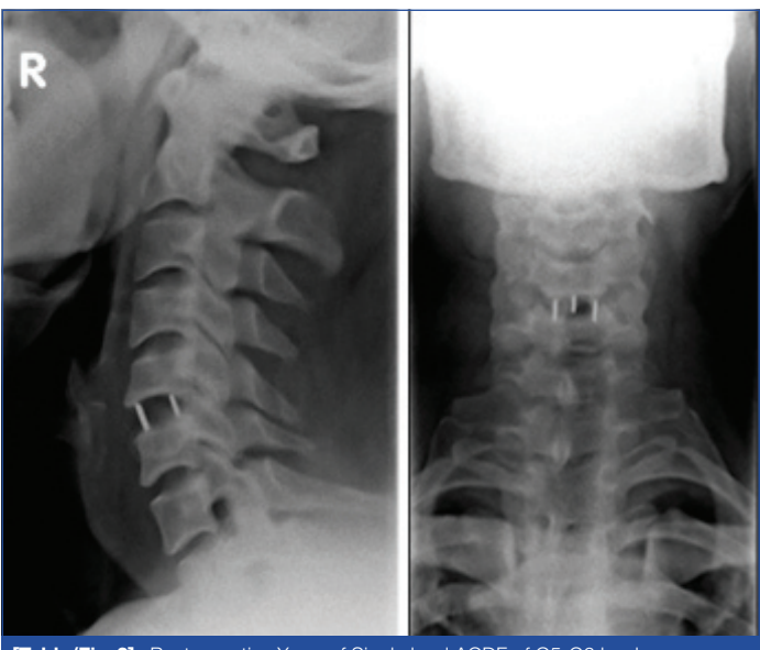
[Table/Fig-2]: Postoperative X-ray of Single level ACDF of C5-C6 level